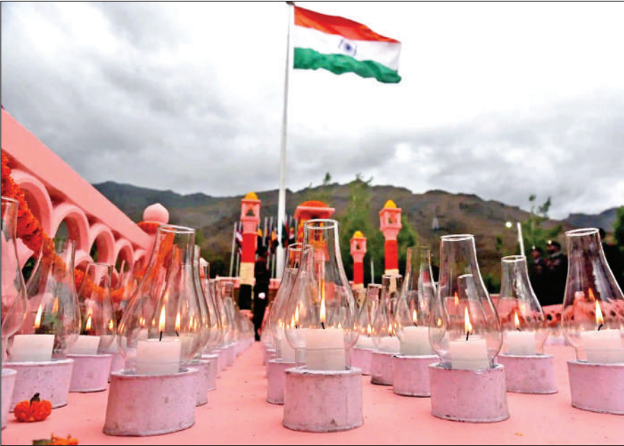
Candles lit at Kargil War Memorial in Drass, Ladakh, in memory of martyred soldiers.