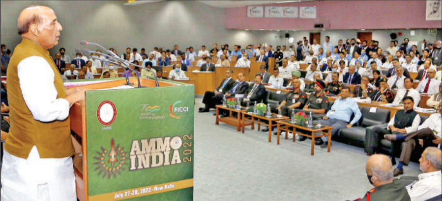
Defence Minister Rajnath Singh addressing the inaugural session of second conference on Military Ammunition (Ammo India) in New Delhi on Wednesday.