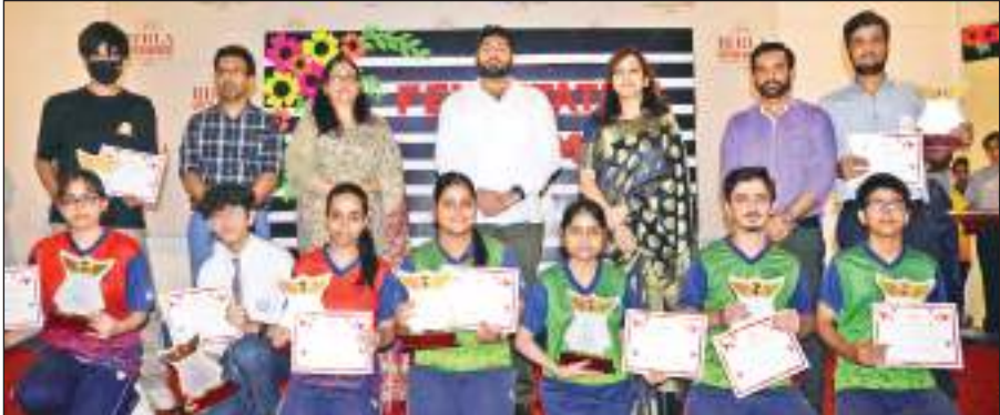
BOMIS faculty honouring meritorious students of class X and XII.

The credit of brilliant results goes to the constant efforts of the students, teachers and the parents, school management said.