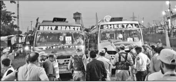
Budda Amarnath Yatra being flagged-off from Jammu.