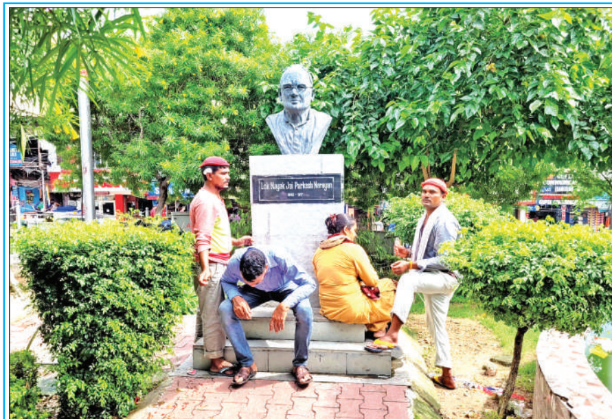
EAR WAXING BOOM: ST photo journalist captures young couple being treated in 'Open Air Ear Clinic' at Gumat Rotary on Friday. (Shilpa Thakur)