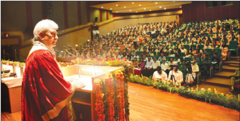
LG Manoj Sinha addressing students of SMVDU at 8th Convocation on Friday.