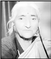
SMT PRABHAWATI PANDITA (KHAR)