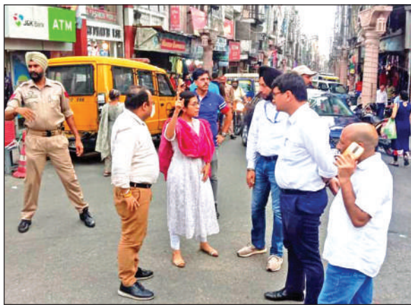
DC Jammu Avny Lavasa during tour of old city.

JAMMU: Deputy Commissioner Avny Lavasa on Tuesday conducted an extensive tour of the old city area including Indira Chowk, Raghunath Bazar, City Chowk, Shallam, Aggarwal Sabha etc.