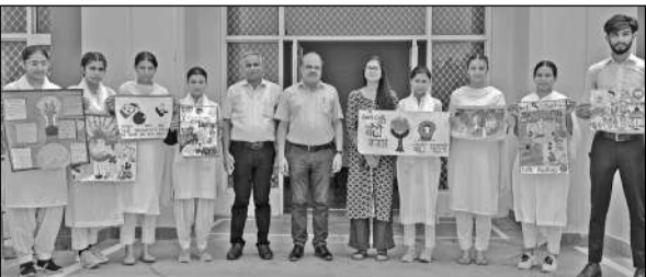
Faculty along with students during the event.