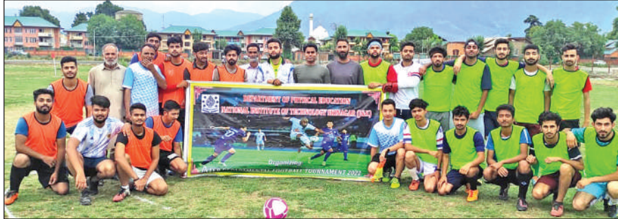
Football teams posing for a photograph with NIT faculty and officials.