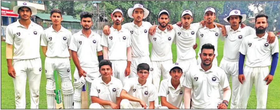
Players posing for a photograph at Sher-e-Kashmir Cricket Stadium in Srinagar on Friday.

At Country Cricket Stadium Gharota, 20 wickets fell on day-1 of the match between JKCA A2