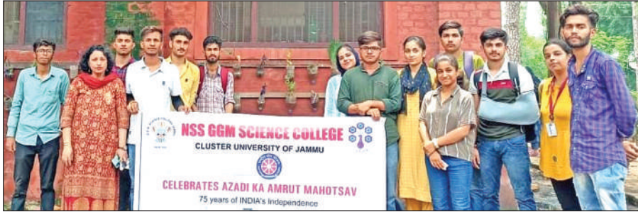
NSS volunteers and faculty member of GGM Science College posing for a photograph.