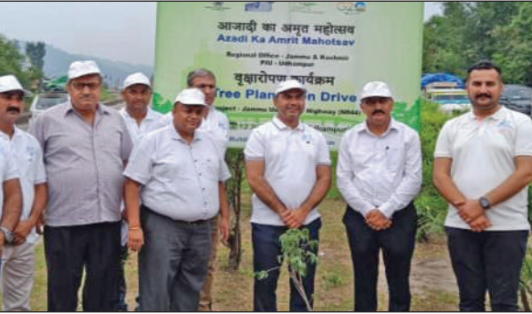
NHAI officials during the drive at Udhampur.

In the instant case, it appears that the order of compulsory retirement has been passed as a shortcut to avoid departmental inquiry.