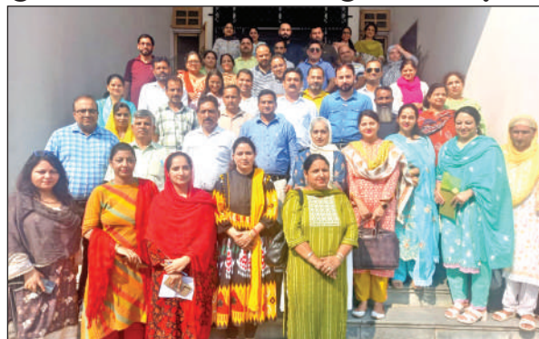
JKSCERT officials along with participants during the programme.