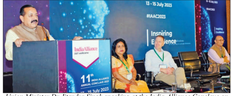
Union Minister Dr Jitendra Singh speaking at the India-Alliance Conclave on the eve of launch of Chandrayaan-3, at Hyderabad on Thursday.

Dr Jitendra Singh said, the impactful journey of India Alliance over the