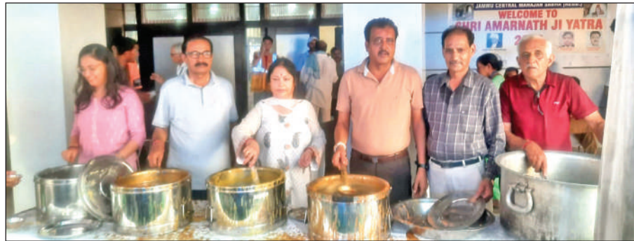
JCMS members serving Langar among Amarnathji pilgrims at Mahajan Sabha.