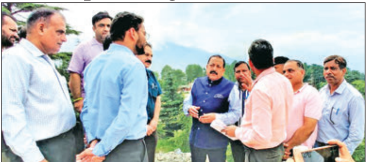
Union Minister Dr Jitendra Singh, accompanied by senior officers, going around to inspect various facilities at newly constructed state-of-the-art Wellness Centre at Mantalai in district Udhampur on Sunday.

Referring to Mantalai project, which is the venue of today's meeting, Dr Jitendra Singh said, the project was initially started by Late Dharendra Brahamechhari, who happened to be the Yog Guru of the then Prime Minister Indira Gandhi and obtained the land on lease. However, midway through the project, Dharendra Bhrabhmechhari suddenly died following an air crash accident and since then the successive Congress governments did not attend to it and allowed it to turn into a shambles. However, he said, it was only after the Modi government took over in 2014 that the project was revived nearly three decades later and now a State-of-the-art Wellness Centre cum Tourist Resort has come up at this location. Similar is the case of River Devika which had remained