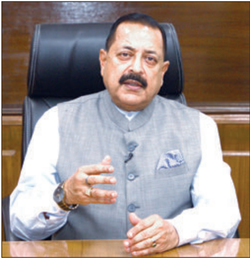
Union Minister Dr Jitendra Singh addressing the International Clean Energy Ministerial (CEM-14) 8th Mission Innovation (MI-8) meet being held at Goa, on Tuesday.

Dr Jitendra recalled that the Clean Energy International Incubation Centre known as CEIIC is a first of its kind International Incubation Centre jointly established by DBT/BIRAC, Tata Trust &