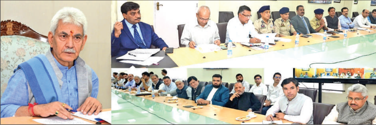
LG Manoj Sinha chairing high level meeting to review Muharram arrangements with eminent representatives of Shia Community, Officials of Civil and Police Administration at Srinagar on Monday.

■ STATE TIMES NEWS SRINAGAR: Lieutenant Governor Manoj Sinha on Monday said that the Union Territory administration and Government of India (GoI) are working with sensitivity and commitment to ensure that all arrangements are made for smooth, safe and hassle-free conduct of Muharram.