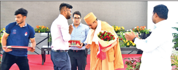
IIM Jammu faculty honouring a dignitary.

The next session was conducted by Bochasanwasi Shri Akshar Purushottam Swaminarayan Sanstha, Delhi on the topic "The Path Less Travelled: Embark on Meaningful Learning Journey". The session was