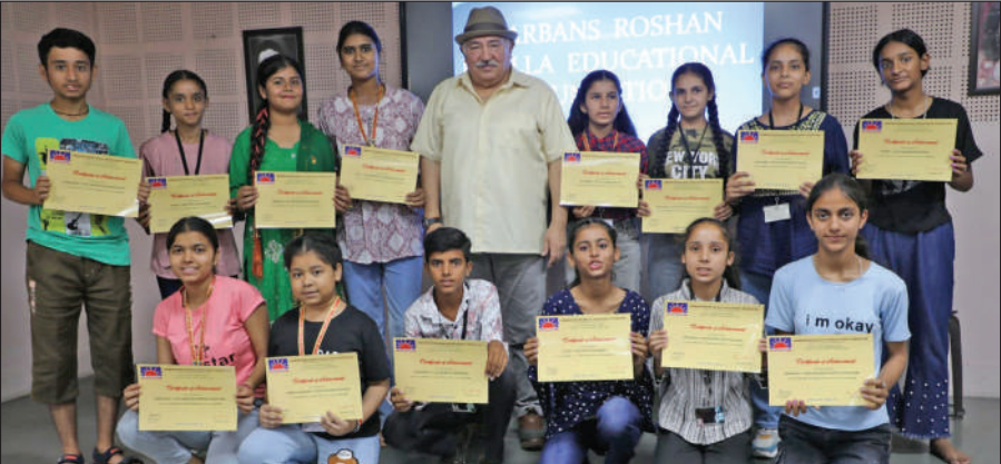
Managing Trustee HRBE Foundation with students after distributing awards.

The children who received awards come from