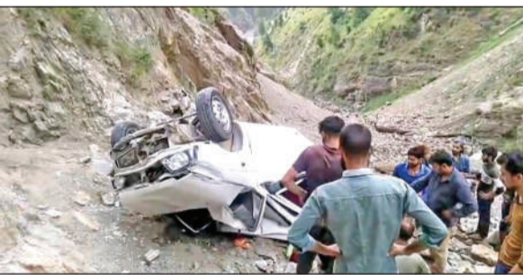
Wreckage of ill-fated vehicle at Dachan area of Kishtwar.