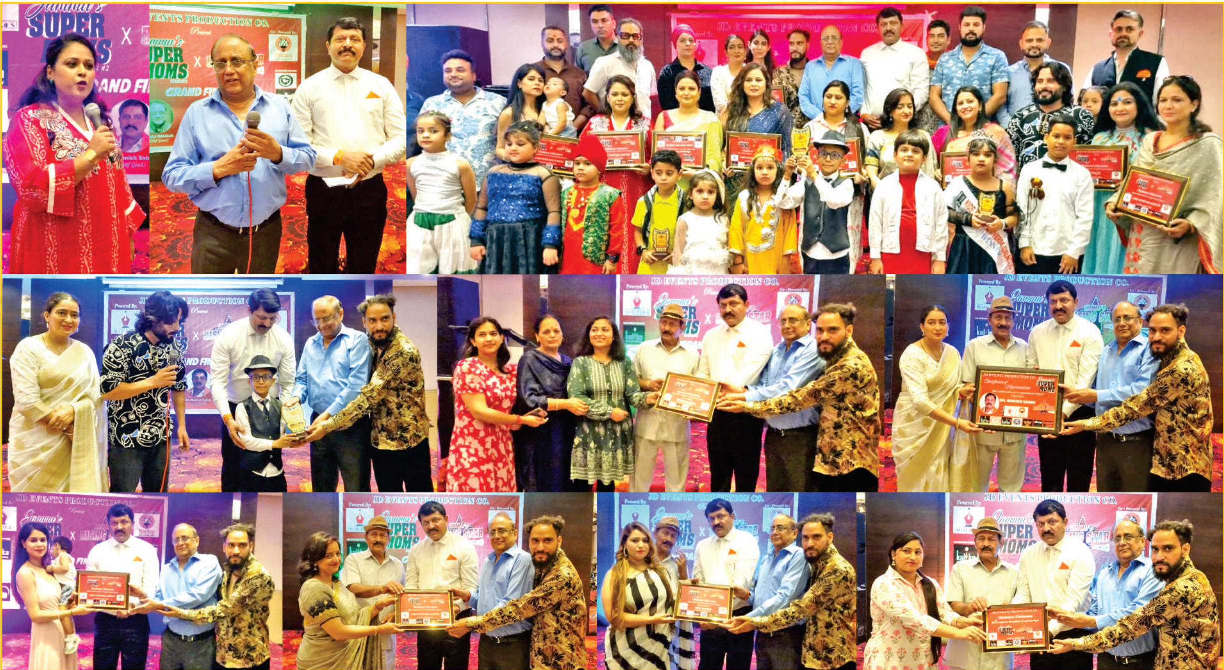
Glimpses of felicitation function in honour of mothers at Lemon Tree Hotel in Jammu on Sunday.

■ STATE TIMES NEWS JAMMU: There is no sorrow in life when mother is around, the world may or may not support but mother's love never decreases.