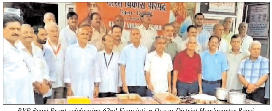
BVP Reasi Prant celebrating 62nd Foundation Day at District Headquarter Reasi.