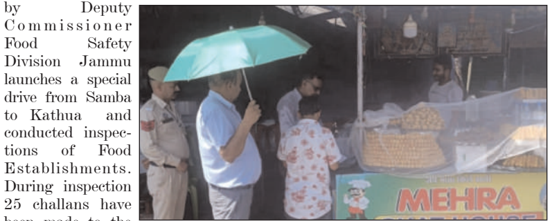
DFCO team carrying out inspection of a vendor.

LAKHANPUR: For pilgrims and Consumers Safety on the Eve of Holy Amarnath Yatra, the team of Food Safety Drugs and Food Control Organization Jammu , led by