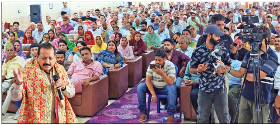
Union Minister Dr Jitendra Singh addressing a public meeting at Udhampur on Sunday.

Addressing a public meeting here, Dr Jitendra said, the developmental projects brought by Prime Minister Narendra Modi do not belong to a particular