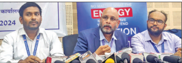
HPCL officials addressing press conference at Jammu.