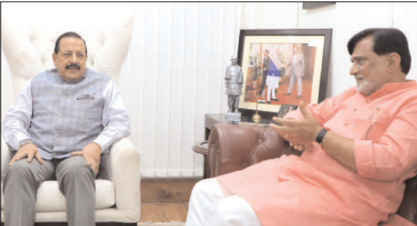
Administrator of Lakshadweep, Daman Diu, Dadra and Nagar Haveli, Praful Patel calling on Union Minister Dr Jitendra Singh at New Delhi on Wednesday.

Patel thanked Minister Earth Sciences Dr. Jitendra Singh for the World's first Low Temperature Thermal Desalination (LTTD) plant which has brought huge relief by providing clean drinking water to people of the Union Territory. Total 9 Desalination plants are approved of which are 7 operational and one more will be operationalized in the coming weeks. The capacity of each