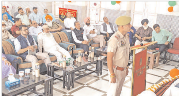
Police officials and others during the programme.