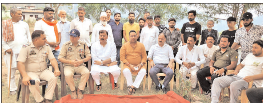
BJP leaders at Shiv Temple in Darmari.