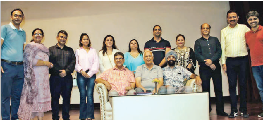
Newly elected team of Jammu Club posing for photograph on Sunday.