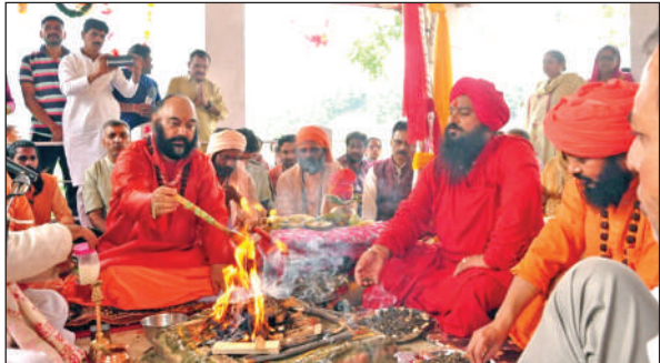
'Chhari-Pujan' and 'Dhawajaroan' ceremony performed at Pahalgam on Sunday.

reverberated the whole atmosphere. A sizeable number of sadhus, pilgrims and numerous Kashmiri Pandit families from Martand were present on the occasion and participated in the puja," he said.