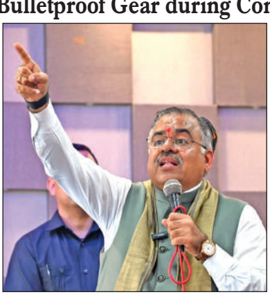
tains and capture those challenging ■ CONTD ON PAGE 9

tioned on the peaks of Kargil. India's brave soldiers had to climb the moun-