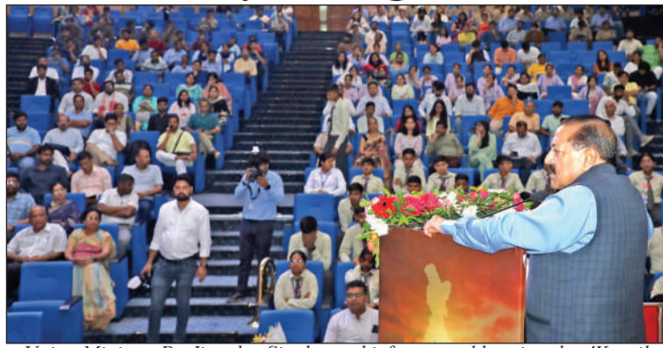
Union Minister Dr Jitendra Singh, as chief guest, addressing the 'Kargil Vijay Divas' programme at Dr Ambedkar International Centre, New Delhi.

tional wars in 1948 and 1965, followed by infiltration bids and a proxy war of "a thousand cuts," Pakistan never reconciled with this reality. The Kargil conflict reinforced the necessity for India to adapt its political and military strategies."