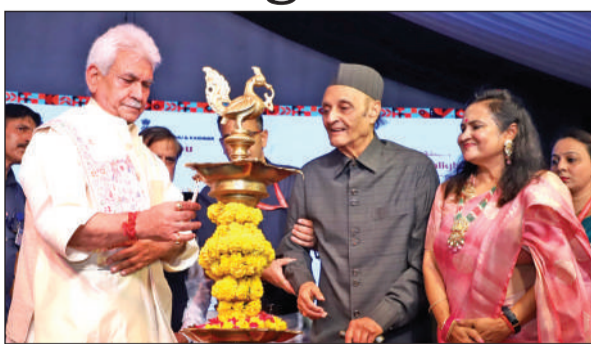
Lt Governor Manoj Sinha lighting ceremonial lamp at inaugural ceremony of second edition of 'J&K Sambhaav Utsav', at New Delhi.

"Sambhaav Utsav 2.0, includes 'Sambhaav Manthan Satra' - a series of thematic sessions especially designed to highlight immense potential of J&K in