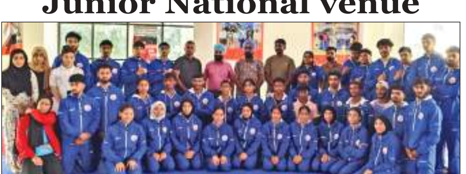
J&K Wushu team posing for a photograph with dignitaries.