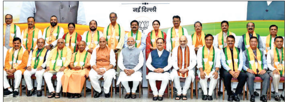
PM Narendra Modi with Defence Minister Rajnath Singh, Union Home Minister Amit Shah, Union Minister and BJP National President J.P. Nadda and others during meeting with Chief Ministers of the NDA-ruled states, at BJP headquarters, in New Delhi on Sunday.

■ STATE TIMES NEWS NEW DELHI: The chief ministers of BJP-ruled states made presentations on