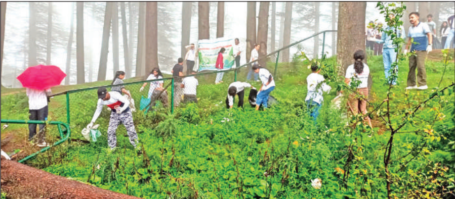
PDA and Tourism Department officials carrying out cleanliness drive.