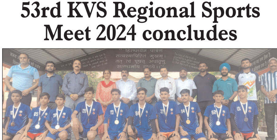
Organisers along with winners posing for photograph.