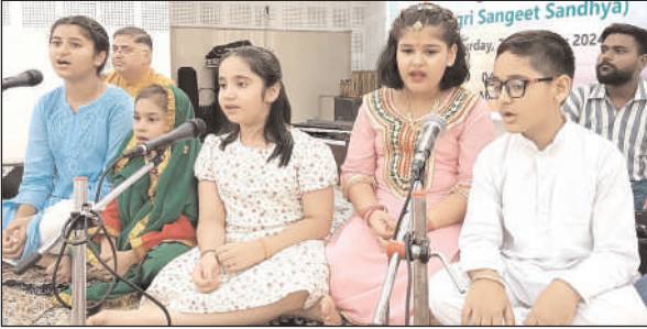
Children presenting dogri song.