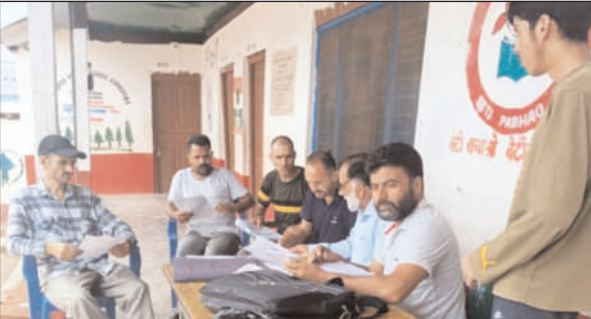
Officials during the camp at Ramban.