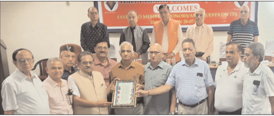
Dignitaries being honoured during the programme.

■ STATE TIMES NEWS JAMMU: In a significant event organized at the Institute of Management and Public Administration (IMPA) near the Jammu University Campus, Hari Prabhu Sanstha, an NGO dedicated to social service, celebrated its 20th Foundation Day and held its Annual General Body meeting. The NGO, known for its commitment to providing pensions to poor widows, scholarships to meritorious children from poor families, running an old age home in Gujroo Nagrota Billawar, offering free computer training for needy students, providing medical assistance to the poor, helping with the marriage of poor girls, organizing periodic medical camps, and numerous other social activities, marked this milestone with a grand celebra-