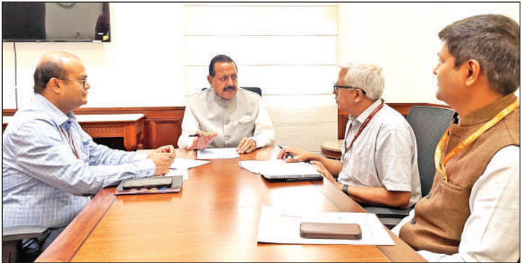
Union Minister Dr Jitendra Singh convening a high level meeting of "Capacity Building Commission" at New Delhi on Monday.