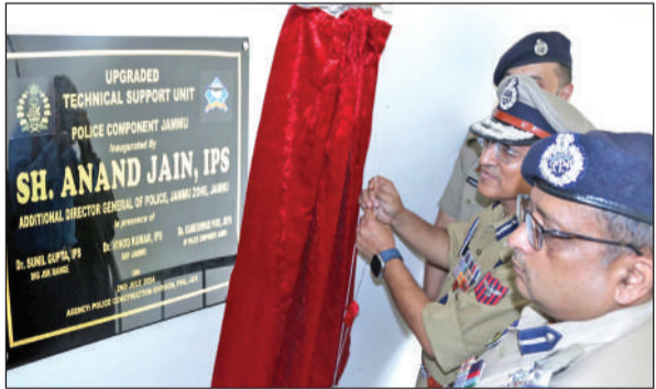
ADGP Jammu Zone, Anand Jain, inaugurating upgraded "Technical Support Unit" at Police Component.

This unit is designed to enhance the police's capability to counter cybercrimes and cyber terrorism. It aims to support and assist district cyber teams in handling vari-