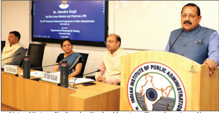
Union Minister Dr Jitendra Singh addressing officers from Army, Navy, Airforce and Civil services at the 50th "Advanced Professional Programme in Public Administration" (APPA) at IIPA, New Delhi on Tuesday.

Addressing the 50th APPA, Union Minister Dr. Jitendra Singh expressed his contention of being a part of the golden APPA. He said the advanced courses imparted to the officers serving the government are crucial to make them future