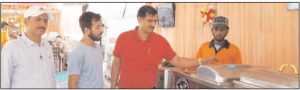
Food Safety officers inspecting quality of food.