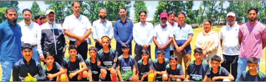
Participating players posing for a photograph with dignitaries.

BARAMULLA: An inaugural ceremony of the Inter District Subroto Mukherjee Football Tournament was organized at Showkat Ali Stadium in Baramulla on Monday.