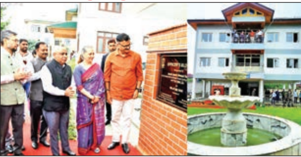
Forest Minister Javed Ahmed Rana inaugurating newly constructed Officer's Block at Deers Hdqrs in Bemina.

The building has been constructed by PWD/R&B Division Srinagar with an