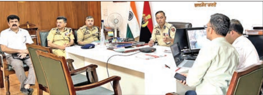
IGP Jammu Zone, Bhim Sen Tuti chairing a review meeting on Wednesday.