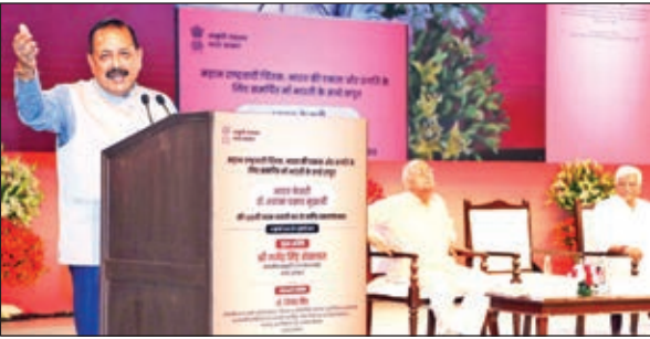
Union Minister Dr. Jitendra speaking during a commemorative event on the occasion of the 125th Birth Anniversary of Dr. Syama Prasad Mookerjee at Sri Fort Auditorium, New Delhi on Wednesday.

"He was not just a political activist but one of the most brilliant scholars of the 20th century," the Minister noted.