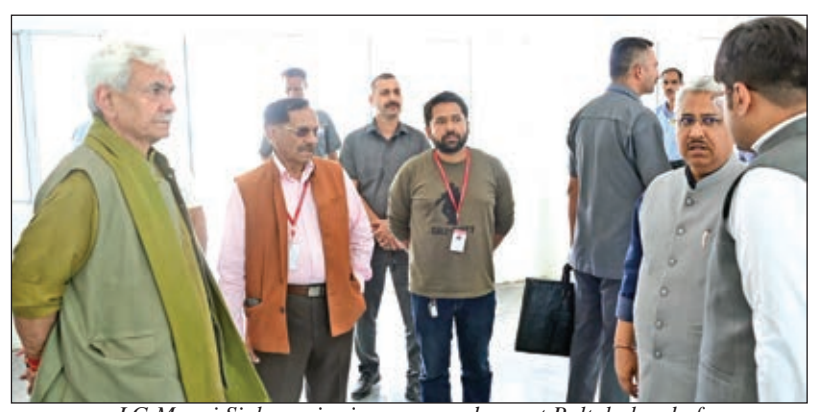
Shri Amarnath Ji Yatra on Monday.