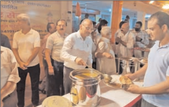
BABAYN members serving Langar among devotees.