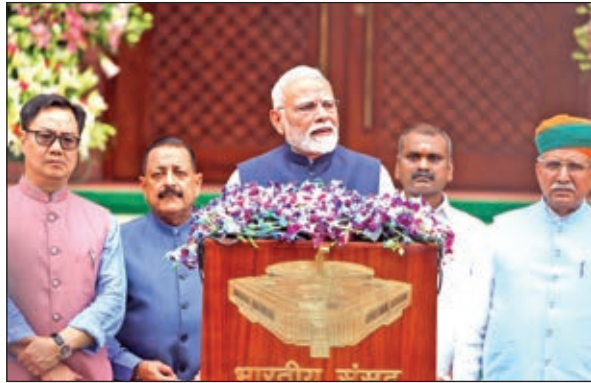
PM Narendra Modi addressing media ahead of Monsoon Session in Parliament House, New Delhi on Monday.

shrinks fast, red zone is turning into green growth zone, he added.