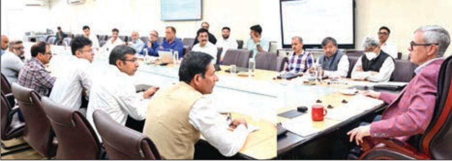
Chief Minister Omar Abdullah chairing a meeting at Srinagar on Wednesday.

During the meeting, the Chief Minister reviewed the progress of key power projects