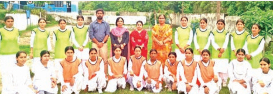
Participating teams posing for a photograph with dignitaries.