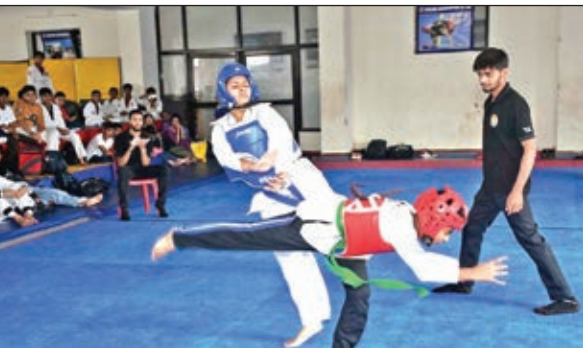
Players in action during taekwondo match.