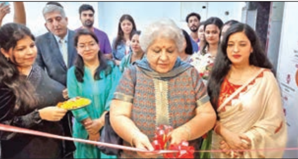
A dignitary inaugurating Nova IVF Fertility in Jammu.