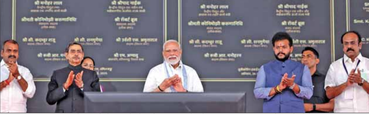
Prime Minister, Narendra Modi, laying the foundation stone for the Transmission System being built by POWERGRID.

■ STATE TIMES NEWS TAMIL NADU: Prime Minister, Narendra Modi, laid the foundation stone for the Transmission System being built by Power Grid Corporation of India Limited (POWERGRID), a 'Maharatna' CPSE under the Ministry of Power, Government of India for evacuation of power from Kudankulam Unit-3 & 4 (2x1000 MW) power plant in a function held at Tuticorin, Tamil Nadu on 27th July 2025. The scheme being implemented by POWERGRID Kudankulam Transmission Limited under Inter-State Transmission System (ISTS) project includes construction of 400 kV D/C (quad) Kudankulam Nuclear Power Plant (3&4)-Tuticorin-II GIS PS Transmission Line & two 400 kV GIS Line Terminal equipments at Tuticorin-II GIS. R. N. Ravi, Governor, Tamil Nadu, Rammohan Naidu Kinjarapu, Union Minister