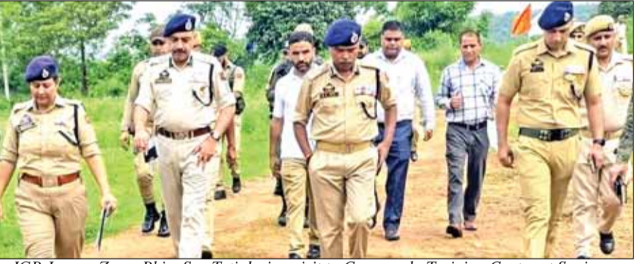
IGP Jammu Zone, Bhim Sen Tuti during visit to Commando Training Centre at Sunjwan.

■ STATE TIMES NEWS JAMMU: In a focused effort to evaluate training preparedness and infrastructure standards, the Inspector General of Police (IGP), Jammu Zone, Bhim Sen Tuti, on Tuesday visited the Commando Training Centre (CTC) at Sunjwan. The visit formed part of a broader review of the facilities supporting the specialized training of J&K Police