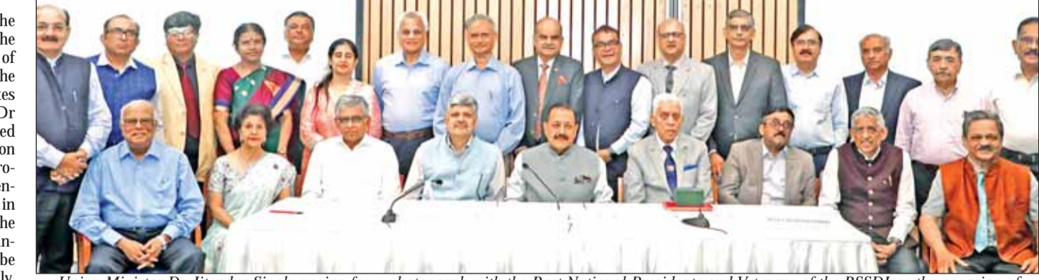
Union Minister Dr Jitendra Singh, posing for a photograph with the Past National Presidents and Veterans of the RSSDI on the occasion of 'RSSDI Foundation Day' at India International Centre, New Delhi on Tuesday.

■ STATE TIMES NEWS NEW DELHI: Addressing the Foundation Day ceremony of the Research Society for Study of Diabetes in India (RSSDI), the largest organisation of Diabetes scholars, Union Minister Dr Jitendra Singh, himself a noted Diabetologist and veteran Patron of the RSSDI, on Tuesday proposed a mass campaign for prevention of Type 2 Diabetes Mellitus in the young. At the same time, he cautioned against Diabetes disinfection which tends to be spread, sometimes inadvertently, from certain quarters. The event was held under the theme: "RSSDI - Past, Present and Future" at the India International Centre, here. RSSDI was founded on this day in 1972 in Delhi. All the Past Presidents and all the veteran Patrons of the 53 year old RSSDI, from across the country, had travelled down to attend the event at Delhi, the city where the first ever meeting of the RSSDI was held. Dr. Jitendra, himself a globally renowned endocrinologist with