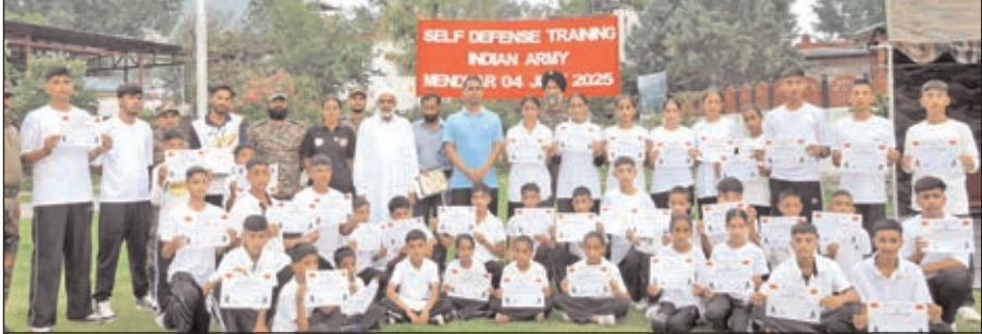
Army officials with others and participating students posing for a photograph.

■ STATE TIMES NEWS POONCH: Army successfully concluded a eight-day Self Defense Training Workshop at Modern Institute of Creative Learning, Mendhar, with a vibrant closing ceremony. The initiative part of the Army's continued outreach efforts, aimed at empowering youth, especially women, by equipping them with essential self defense techniques and safety awareness. The workshop, conducted by Taekwondo Expert Tabasum Nusrat Ali, witnessed enthusiastic participation from over