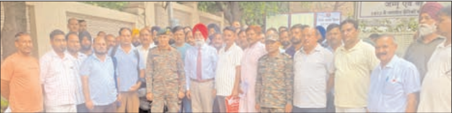
General Officer Commanding, Tiger Division during interaction with veterans.