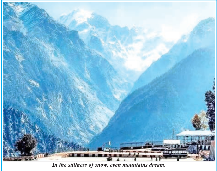
In the stillness of snow, even mountains dream.