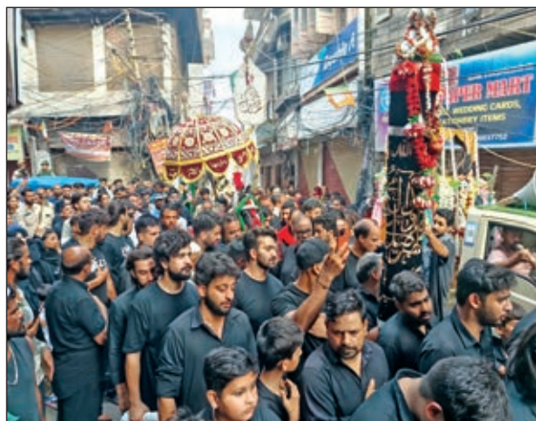
Muslim brethren taking out Muharram procession in Jammu on Sunday.