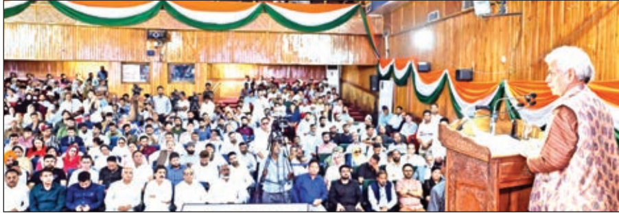
LG Manoj Sinha speaking at an event organised to pay tributes to Dr Syama Prasad Mookerjee on his Birth Anniversary at Srinagar.

The Lieutenant Governor observed that the J&K has launched the 2-year celebratory campaign to honour the life and legacy of Dr. Syama Prasad Mookerjee and his role in strengthening national unity and advocating 'One