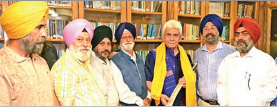
Delegation members of Gurdwara Prabandhak Committee, District Baramulla calling on LG Manoj Sinha on Monday.