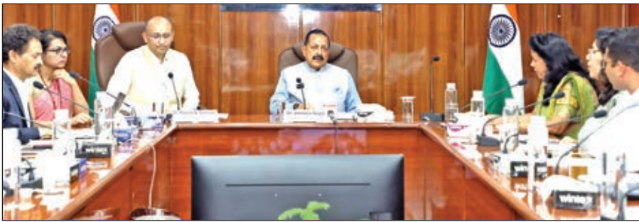
Union Minister Dr. Jitendra Singh addressing the nationwide Dialogue series held to mark the "World Bioproduct Day" at New Delhi on Monday.

Calling the format a "beautiful hybrid model," Dr. Jitendra Singh praised the decentralised and inclusive outreach. "This is more than a science event. It's an outreach movement," he said, adding that involving students, startups, and industry leaders was essential to make