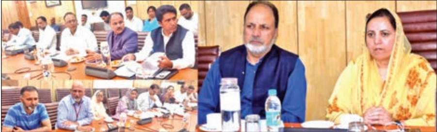
Cabinet Minister Sakeena Itoo chairing a meeting at Srinagar.

The Minister emphasized on the critical importance of strengthening the healthcare delivery system at grassroots level. She highlighted that health sector is an important sector for societal develop-