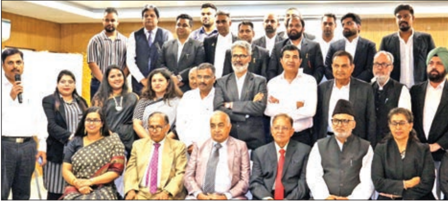
Former Judges along with advocates and judicial officers during the conference.