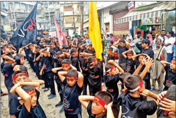
Ashoora procession being taken out in Jammu on Tuesday.