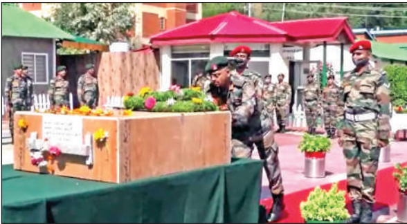
Last respects being paid to Indian Army's dog, Axel, who lost its life in action after being hit by a bullet in an operation.