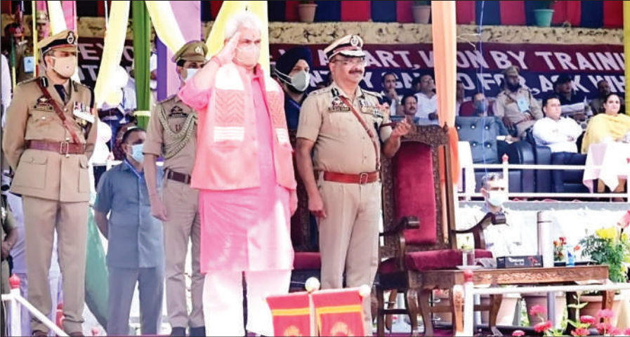
LG Manoj Sinha attending passing out parade of JKP Constables at Manigam Police Training School on Sunday.

‘JK Police finest example of superior internal security machinery’