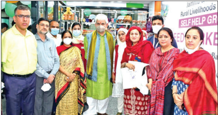
Lt Governor Manoj Sinha after inaugurating "UMEED Market Place" under AVSAR Scheme of Airport Authority of India at Srinagar Airport.