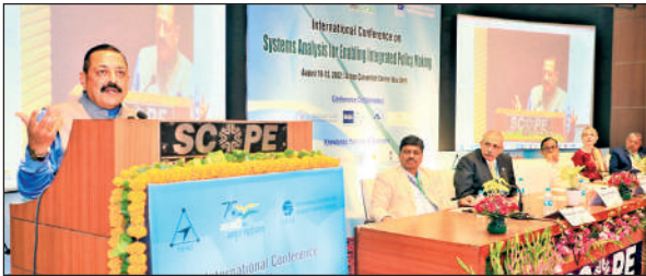
Union Minister Dr Jitendra Singh delivering inaugural address at International Conference at New Delhi.

Dr Jitendra said, under Prime Minister Modi, India has presented a roadmap to the world about the mitigation measures by building upon the principle of Common but