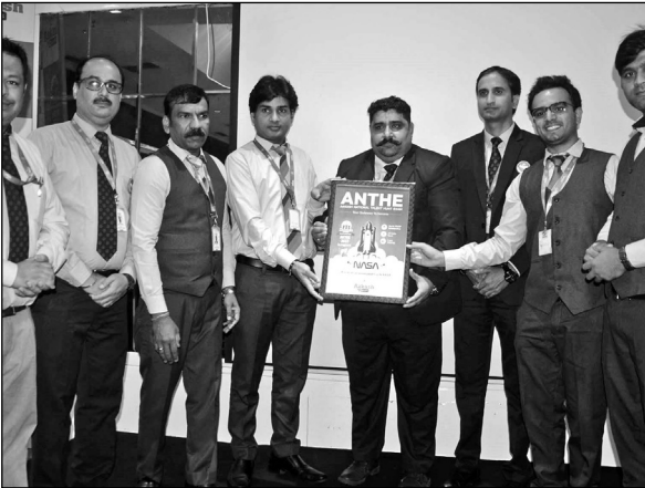
Management of Aakash BYJU'S launching 'Education for All' towards empowerment of girl child initiative.